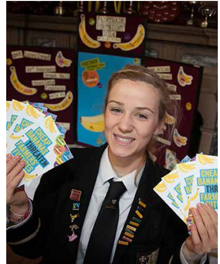
Fairtrade Fortnight 2014 at Lichfield Cathedral School

Fair Trade or fair trade products do not carry the FAIRTRADE Mark. They relate to the wider movement of organisations working to promote fairer trade policy and practice and include fairly traded products like handicrafts, some jewellery and toys.